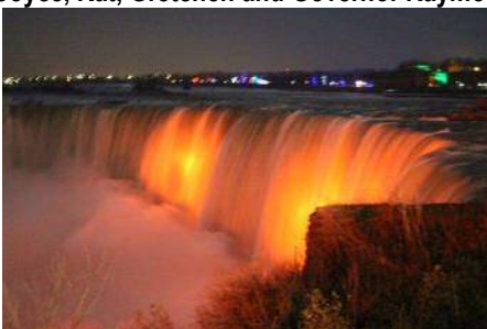
The Falls Lighted Orange!!!