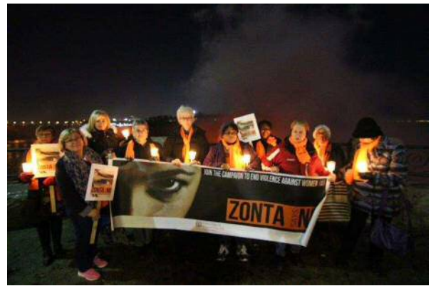
Lighting the Falls Orange. Members from both Clubs holding Zonta Says No Banner and Candles.