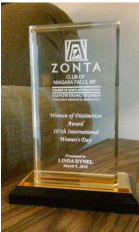
Woman of Distinction Award