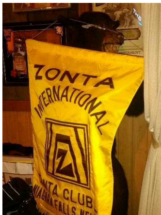
Bear holding Zonta Banner at January Meeting at the Bakery